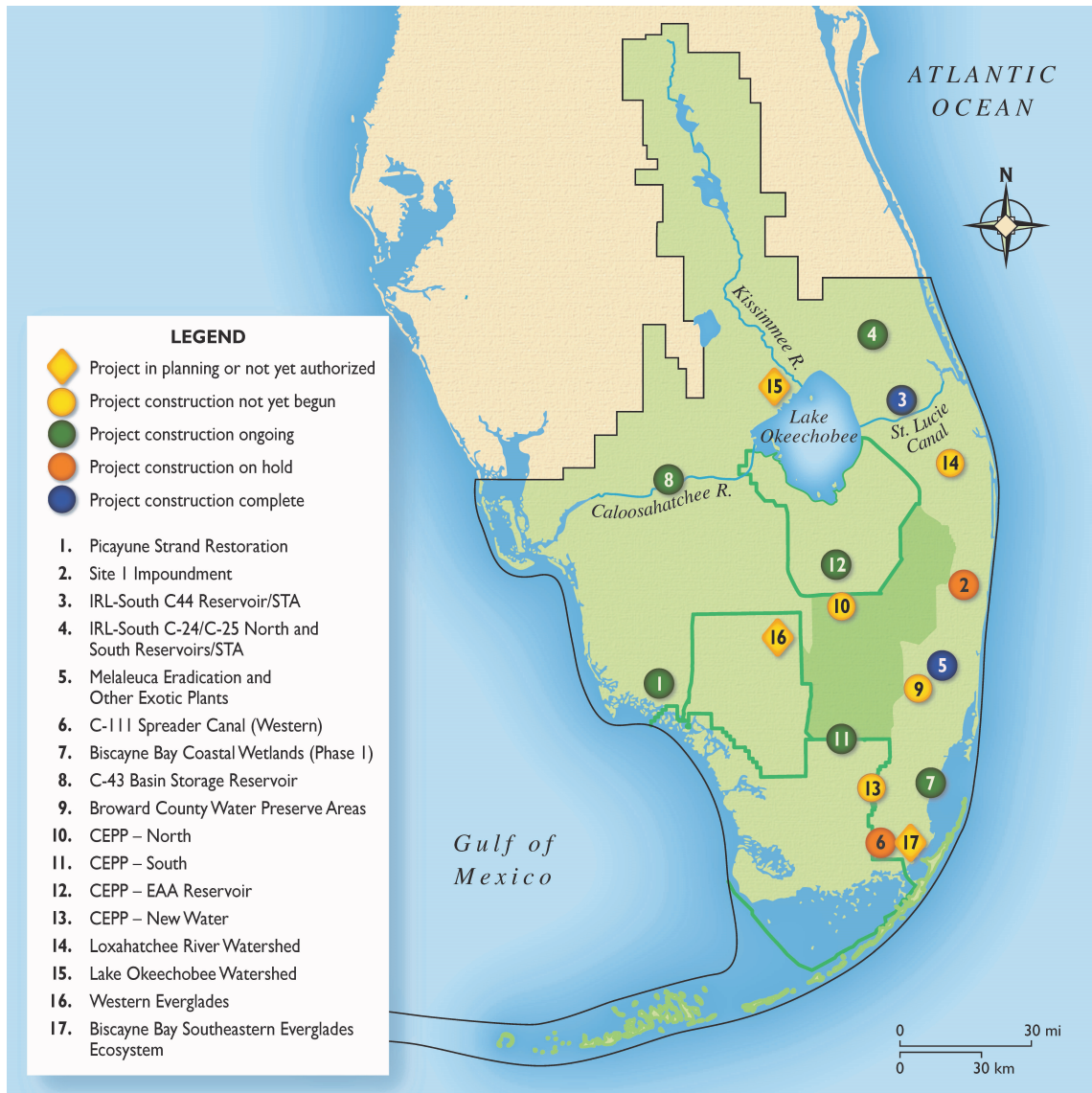
FIGURE 1. Locations and status of CERP projects.

Hydrologic restoration progress and early vegetation response is evident over large areas of the central and western Everglades after implementation of recent CERP and non-CERP initiatives, with the rehydration of Northeast Shark River Slough in Everglades National Park representing the largest step yet toward restoring the hydrology and ecology of the central Everglades. Signs of progress include increasing hydroperiod (days per year when the soil is waterlogged) and shifts in vegetation in Everglades marl prairies and in Picayune Strand. The pace of current implementation efforts increase the need for and importance of sophisticated strategies to analyze and synthesize natural system responses.